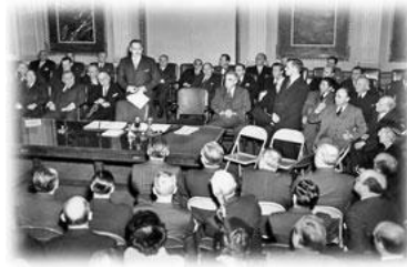
U.S. Acting Secretary of State Dean Acheson addresses representatives of 28 nations gathered to sign the Bretton Woods Monetary Agreement, December 27, 1945