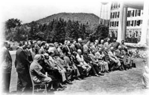
Delegates in front of the Mount Washington Hotel, July 2, 1944

Fred Vinson, the U.S. Secretary of the Treasury, said at the time of the formal signing of the Bretton Woods Agreements: "History is being written today as we execute these documents and breathe the breath of life into the International