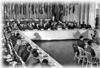
The U.S. Secretary of the Treasury, Henry Morgenthau, Jr., addresses the delegates to the Conference, July 8, 1944