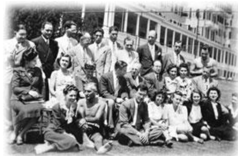
An informal gathering of the attendees of the Conference, July 1944

Monetary Fund and the International Bank for Reconstruction and Development. We can be thankful that the history we are now writing is not another chapter in