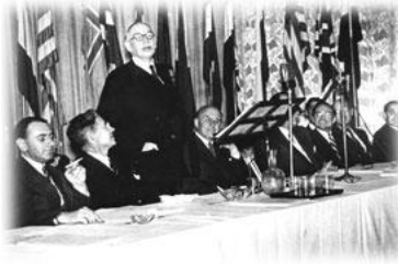
Lord Keynes addressing the Conference meeting, July 1944